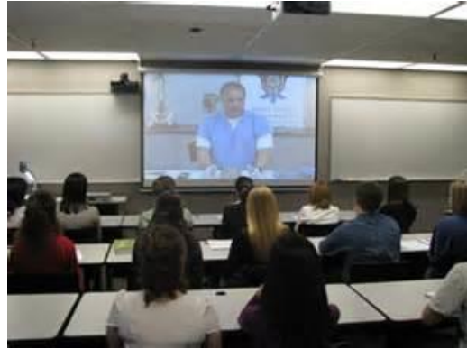
Idaho Education Network Classroom