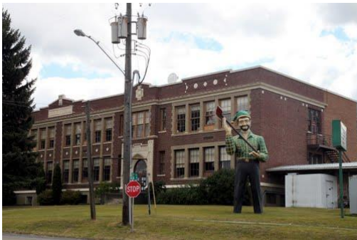
Heyburn Elementary School

Greetings and welcome to St. Maries Joint School District No. 41. For years, St. Maries School District has been recognized as a leader in quality educational opportunities. We recognize the role of parents in the success of our students, and we are humbled by the level of trust our parents demonstrate by allowing us to teach their students. We have accomplished a great deal through close cooperation between teachers, administrators, parents, patrons, and local businesses all working toward the common goal of helping our students become successful. We are dedicated to providing an educational culture that will continually assess the knowledge, changing needs, and challenges of our students and adapt our practices to prepare them to become successful citizens.